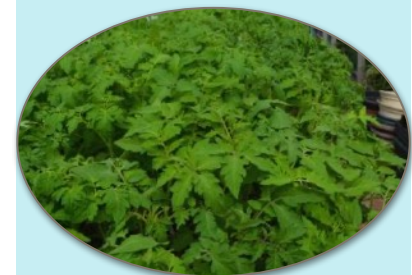
Tomatoes & Peppers

Sale Includes a Selection of Annuals and Perennials