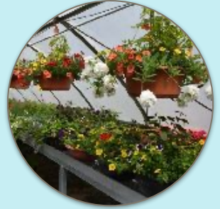
Assorted Hanging Baskets